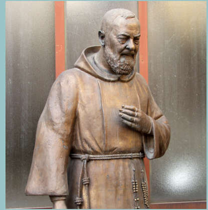
St. Pio of Pietrelcina